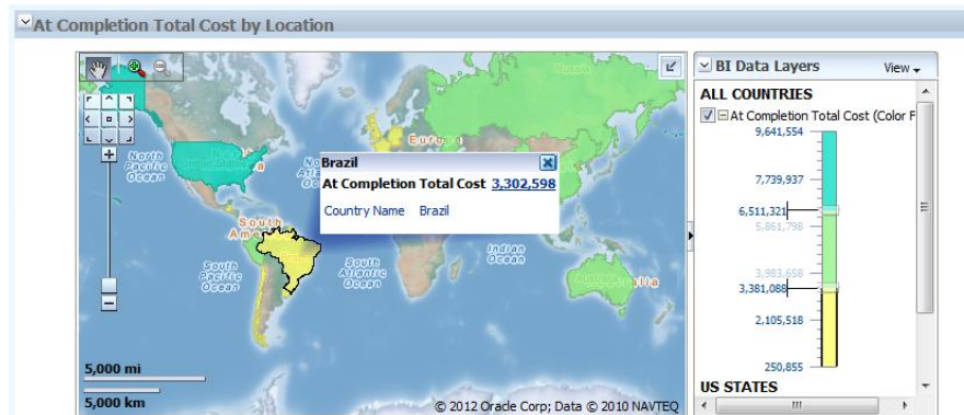
Figure 3. Geospatial maps allow project, cost, business process, resource and activity metrics to be visualized by geographic location with full drilldown capabilities.

Primavera Analytics will give your entire organization a single BI solution where published project performance indicators, trends, statistics, graphs and geospatial maps are available through a self-service portal. With the flexibility of the Oracle BI engine, you can combine your project data from your instances of Primavera Unifier and Primavera P6 EPPM with information from your ERP systems, financial data, or customer data to create a single view of the truth across the enterprise. This provides an increased level of transparency and visibility into your business processes and project performance that are required to maximize efficiencies and return on investment.